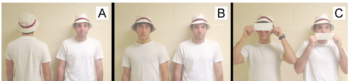
Figure 2. Stimuli used in Flombaum and Santos (2005): A) Experiment 1. Subjects chose the competitor facing backwards, B) Experiment 4. Subjects chose the competitor with his eyes to the side, C) Experiment 6. Subjects chose the competitor with his eyes covered.

The Cayo Santiago macaques spend much of their day foraging for monkey chow provisioned to them by human experimenters. However, due to the long history of research on this island, the monkeys in this population have also developed a compelling interest in the foods that they see human experimenters eating. (Human foods tend to be sweeter and more exciting than the monkey chow they normally eat.) Because of their curiosity for human foods (see Santos et al., 2001), the macaques often approach experimenters and attempt to steal their food, so much so that we and our colleagues typically use this approach behavior as a dependent measure in empirical studies with this population (see Flombaum et al., 2004; Hauser, 2001; Hauser et al., 2000; Phillips and Santos, in submission; Santos, 2004; Santos et al., 2001; Santos et al., 2002 Sulkowski and Hauser, 2001). In these studies, subjects always appeared somewhat apprehensive of getting close to the experimenters involved in testing, suggesting the macaques may view humans as potentially dangerous competitors. As such, we reasoned that these monkeys should be motivated to take human food only when they can do so without being detected.